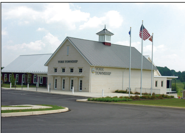
The York Township Recreation Department office is located inside the York Township Municipal Building at 190 Oak Road.

The York Township Recreation Department takes pride in our achievements and our service to the community. We look forward to the future and all the exciting recreational possibilities it offers.