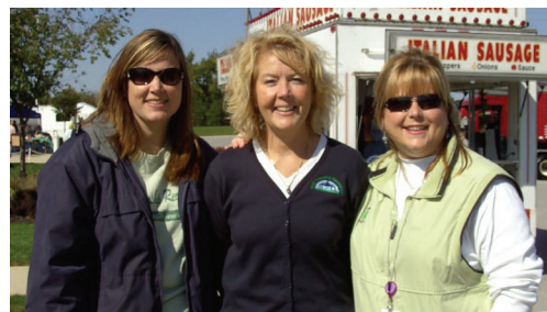
York Township Recreation staff at the 2010 Fall Fun Fest.

The York Township Recreation Department is dedicated to developing programs and facilities that will encourage healthy leisure lifestyles, strong family bonds, community pride and personal fulfillment for York Township citizens and the surrounding community.